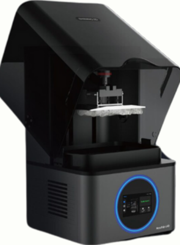
AccuFab-L4D 3D Printer