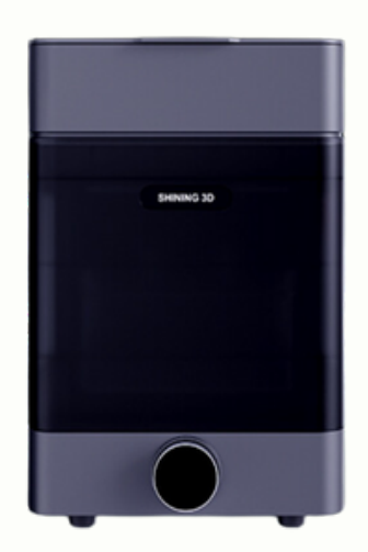
FabWash Washing Unit