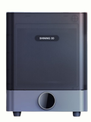
FabCure 2 Post-curing Unit